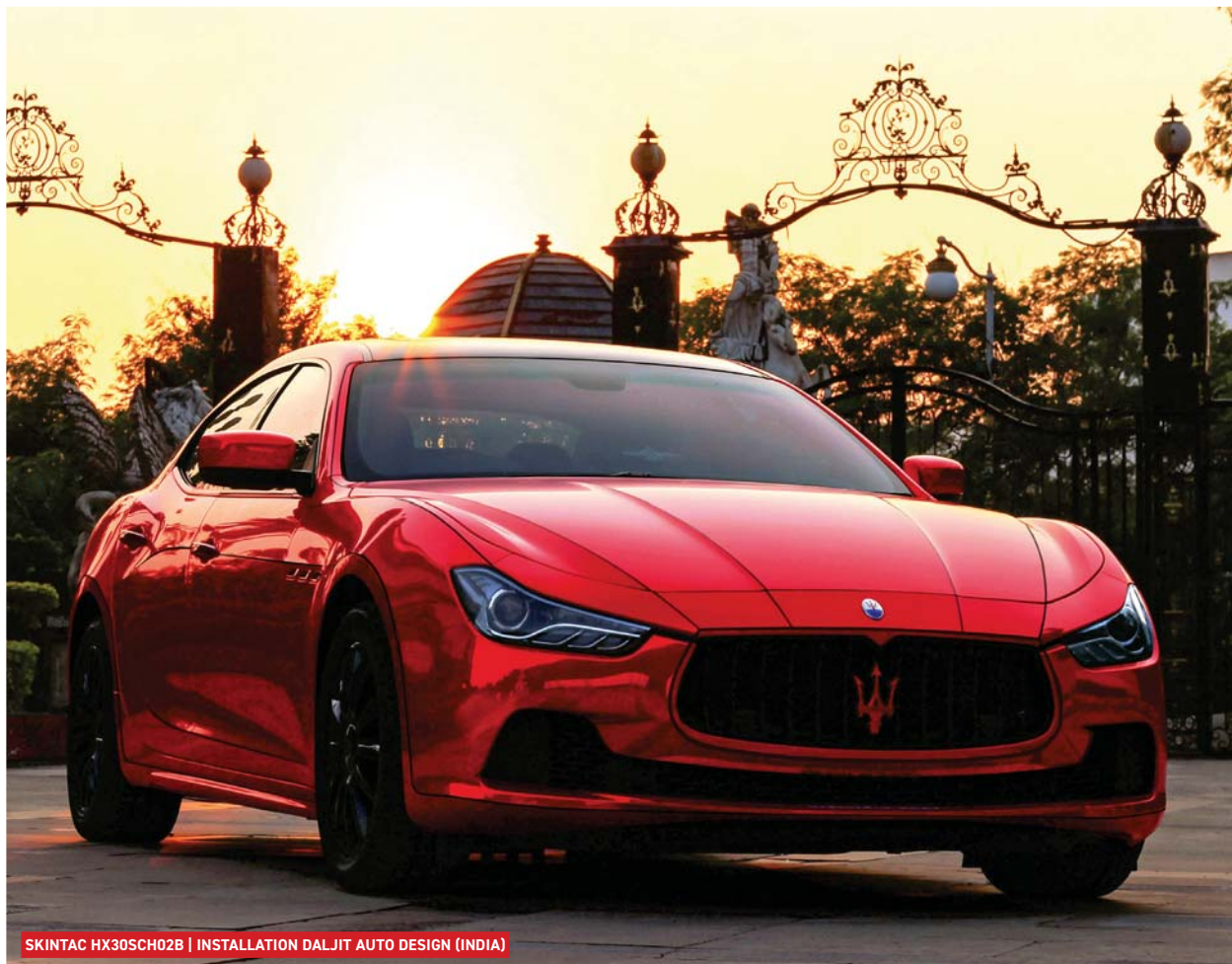
SKINTAC HX30SCH02B | INSTALLATION DALJIT AUTO DESIGN (INDIA)