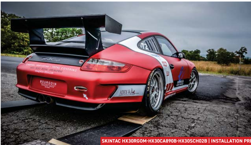
SKINTAC HX30RGOM-HX30CA890B-HX30SCH02B | INSTALLATION PRESS-CITRON