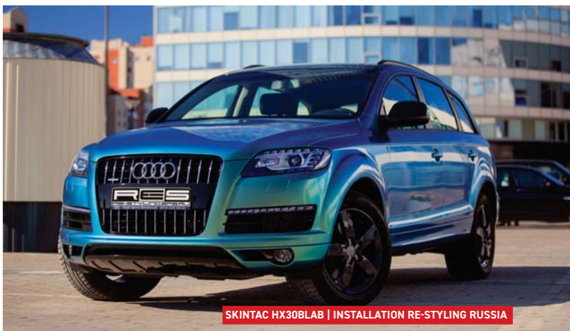
SKINTAC HX30BLAB | INSTALLATION RE-STYLING RUSSIA